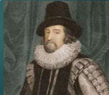
Francis Bacon 1561-1626