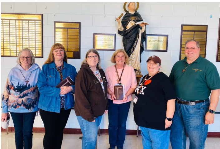
Greccio Council - Derry, NH