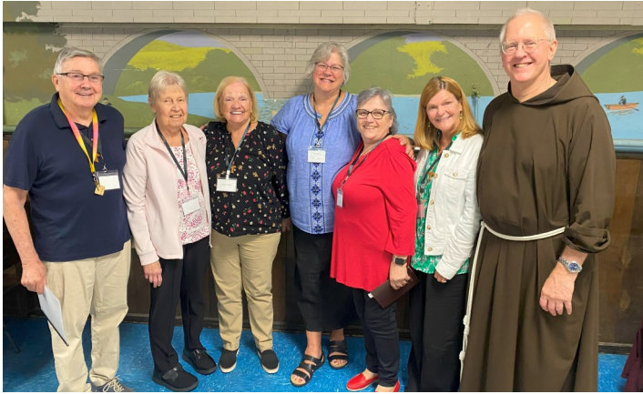
St Francis Council – Milton. MA