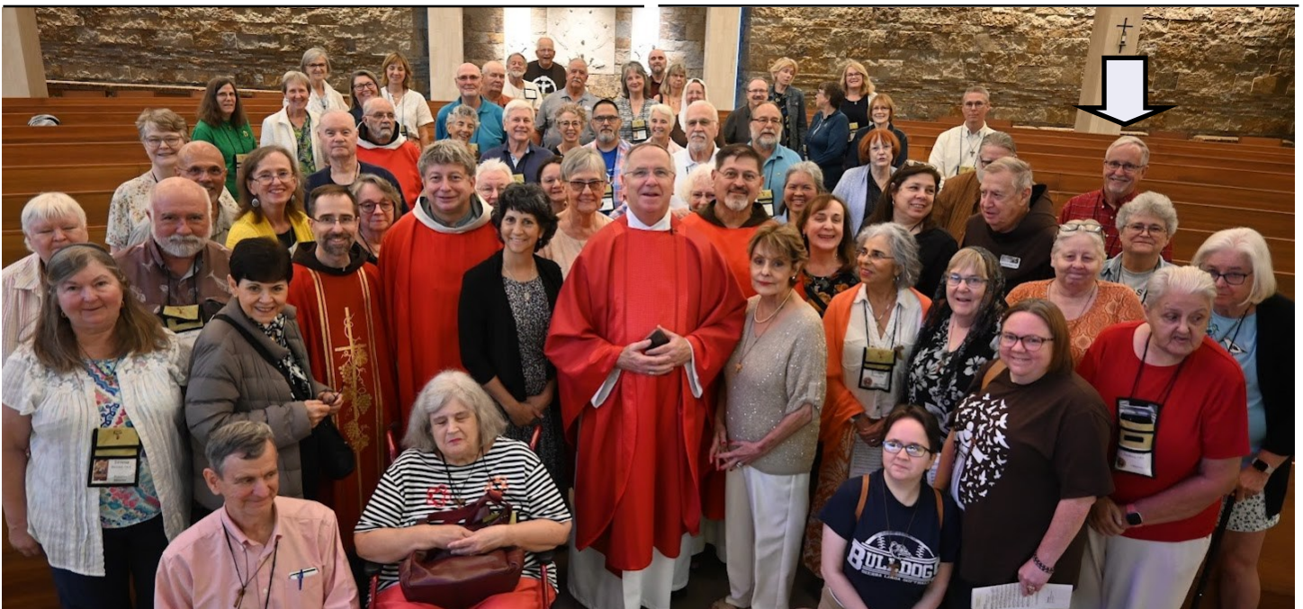
Pictured below: The National Fraternity at the 2024 Chapter in Phoenix Arizona. The National Fraternity is comprised of all the Regional Ministers and the National Executive Council.

The St. Elizabeth of Hungary Regional Executive Council wishes you and your loved ones a blessed Advent and Christmas Season!