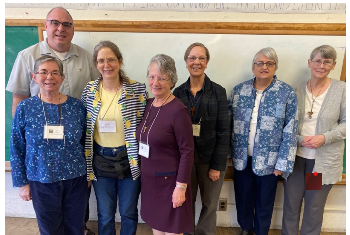
St Mary of the Angels Council St. Johnsbury, VT