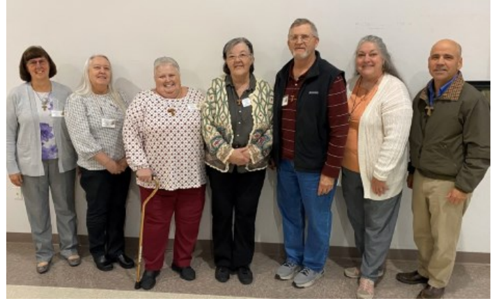
St Michael and the 9 Choirs of Angels Council, Rochester, NH