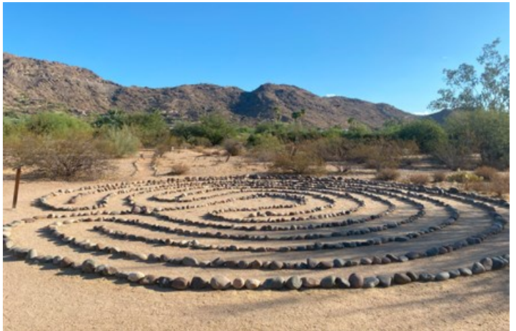
Labyrinth at The Casa Franciscan Retreat Center in Scottsdale, Arizona.