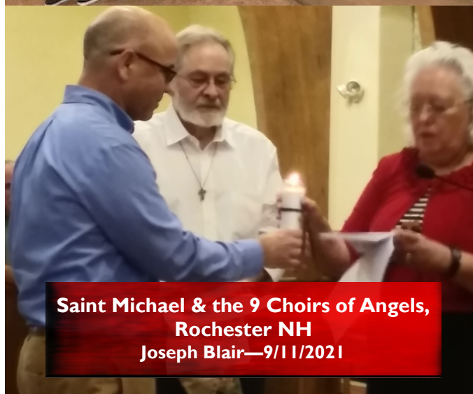
Saint Michael & the 9 Choirs of Angels, Rochester NH