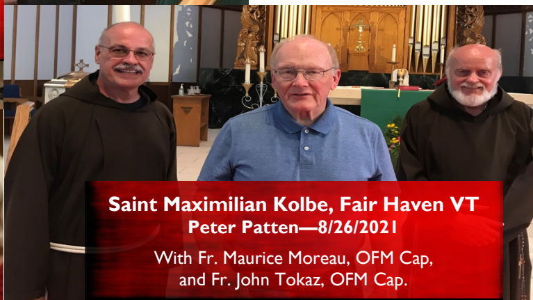
Saint Maximilian Kolbe, Fair Haven VT